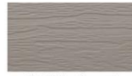
Vinyl Siding: Stonecrest