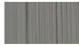
Vinyl Shakes: Charcoal