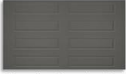
Garage Door: Bronze Long Panel