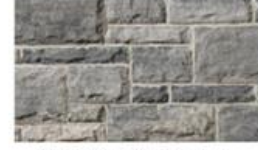
Stone: Artiste Marble Grey