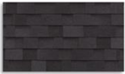
Shingles: Dual Black